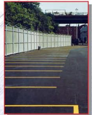
Coliseum Bus Depot New York, NY