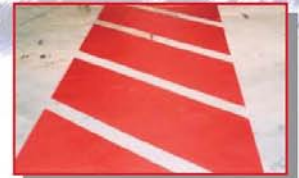
Coliseum Bus Depot New York, NY